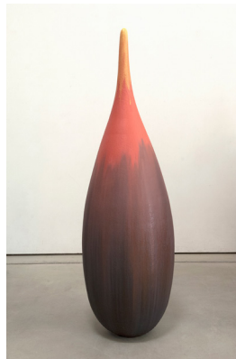
Teardrop Red , 2010, h. 61 x dia. 19 inches.